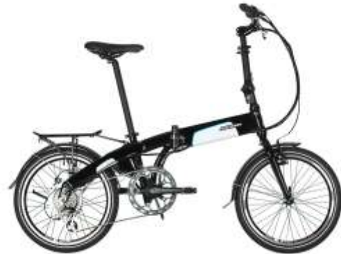
Figure 1 Raleigh Stow E Way

This bike can be folded into 90x50x70cm 3 and can run up to 24 miles in single charge. It uses Li-ion battery and it is hidden inside the frame, thus it is very good looking. It costs around £1350 (approx.. 1 lakh INR)