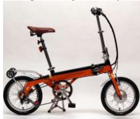
Figure 2 Whoosh Gallego

This cycle comprises of a 270 WH Li-ion battery. It takes just 5 seconds to fold up and it can be rolled after folding. Two smaller wheels are attached for this purpose. It is a value bike and costs about half of the previous one. Cost - £669 (about 53000 INR)