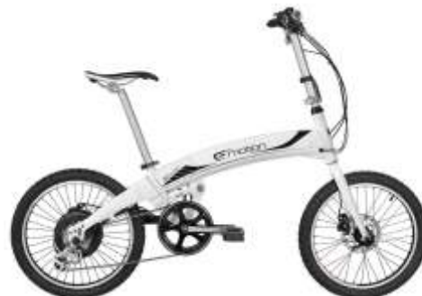
Figure 4 BH Emotion Neo Volt Sport Lite

This bike looks very simple but it has very good power. It can also be assisted by pedals and it can reach up to 20mph speed. But this model is very costly, around £2199 (around 175000 INR)