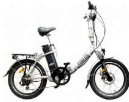
Figure 5 FreeGo Folding

This model is focused at large distance travel. It consists of a 16Ah battery. Some of the salient features are head lamp and front disc brake. Though, it is very heavy around 22 kg. It costs £1,099 (around 88000 INR)