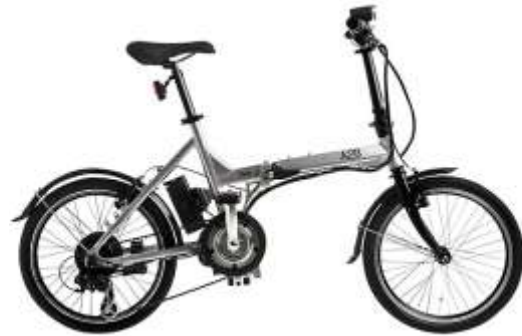
Figure 3 A2B Kuo

This bike is quite advanced than the previous ones. It consists of an electronic display which shows the level of battery used. The battery is placed inside the seat tube and it takes about 6 hour to charge for 25 miles. It costs £999 (about 80000 INR)