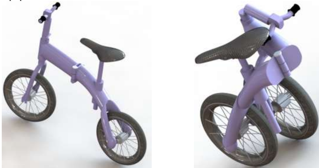
Figure 6: 3D Rendered Images of Bicycle (Unfolded on left, Folded on right)

It's also water- and chemical-resistant. ABS does produce a slightly unpleasant smell when heated, and the vapor can contain some nasty chemicals. Because ABS is broken down by UV radiation, it isn't suitable for long-term outdoor use, as it loses its color and becomes brittle [10]. Considering all these factors, ABS is the best for the purpose.